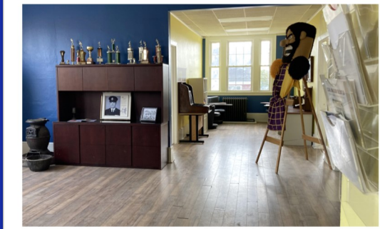
(Artifacts on display in the Heritage Room)

On July 30 from 5-7pm, join Council in the new Heritage Room—located on the top floor above the library—for a Homecoming Reception!